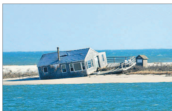
A North Beach cottage in Chatham is left damaged after the weekend storm.

Very steep, unstable cliffs: White Crest Beach, Wellfleet Newcomb Hollow Beach, Wellfleet Cahoon Hollow Beach, Wellfleet